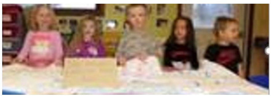
Learner children made quilts for foster children.