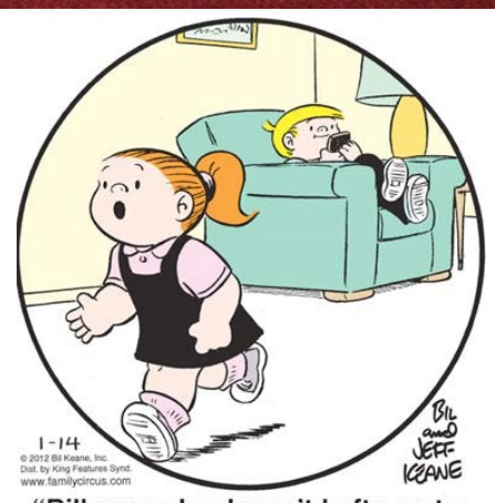
'Billy says he doesn't hafta go to church anymore 'cause his phone has an app for that!"